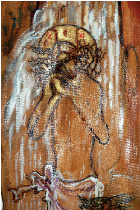
Image: Painting of Christ's Baptism from a hospital building in the United Kingdom.